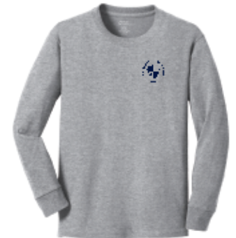
PC54YLS/PC54LS Long Sleeve T-Shirt Athletic Heather Youth XS-XL, Adult SM-4XL