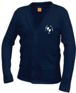
6300 Classroom Cardigan Sweater Navy Youth XXS-XL, Adult S-5XL