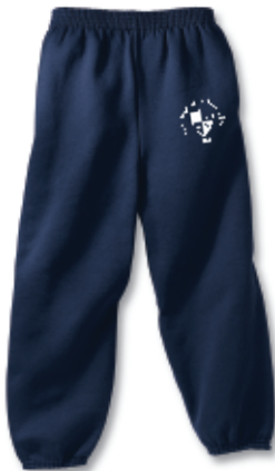
PC90YP/PC90P Essential Fleece Sweatpant with pockets Navy Youth XS-XL, Adult XS-4XL

*Gym wear will be available in-stock at the 700 Shop