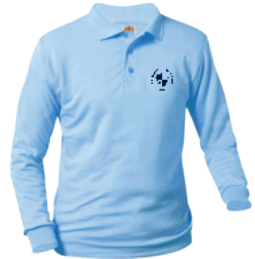
8326 Jersey Knit Long Sleeve Blue Youth XXS-XL, Adult S-3XL