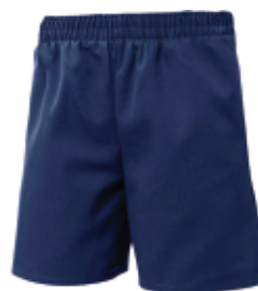
7067 Youth Full Elastic Waist Short Navy XXS-XL *Elastic shorts can be worn by K-3 only

*Shorts may only be worn May 1st thru Oct 1st