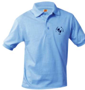
8320 Jersey Knit Short Sleeve Blue Youth XXS-XL, Adult S-5XL