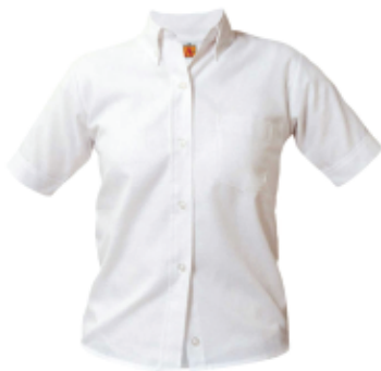
9503 Traditional Oxford Short Sleeve White Youth 4-16, Womens XS-3XL