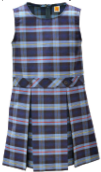
1194BP Youth Jumper Model 94 (Drop Waist Shift Jumper) Navy/Blue Plaid (P41) 3-18, Half Sizes 6H-18H *Jumpers can be worn by K-3 only