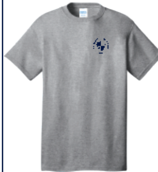
YPC54/PC54 T-Shirt Athletic Heather Youth XS-XL Adult S-4XL

*Gym wear will be available in-stock at the 700 Shop