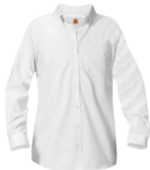
9506 Traditional Oxford Long Sleeve White Youth 4-16, Womens XS-3XL

On Mass Day, you are required to wear an Oxford shirt (short or long), Cardigan (if needed), and a Jumper (Grades K-3), or a Skirt and Criss Cross Tie (grades 4-8). Appropriate shoes are to be worn. No Sneakers.