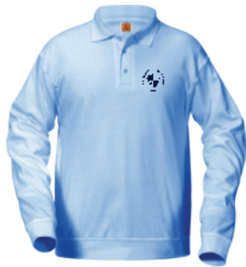
8317 Ribbed Bottom Long Sleeve Blue Youth XXS-XL, Adult S-3XL