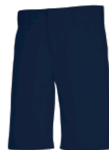
7876 Mid-Rise Plain Front Shorts Navy Youth 3-16 (Reg), 7-16 (Slim), Half Sizes 6H-18H Juniors 0-27 *Belts are required

*Shorts may only be worn May 1st thru Oct 1st