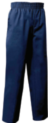
7059 Youth Full Elastic Waist Pants Navy XXS-XL *Elastic pants can be worn by K-3 only