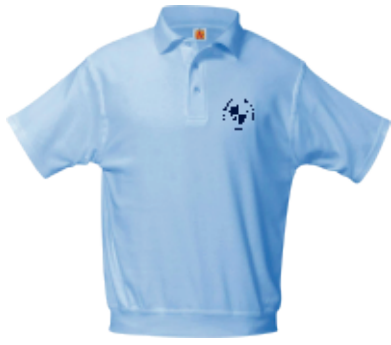
8311 Ribbed Bottom Short Sleeve Blue Youth XXS-XL, Adult S-3XL