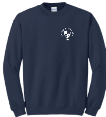
18000B/18000 Traditional Sweatshirt Navy Youth XXS-XL, Adult S-3XL