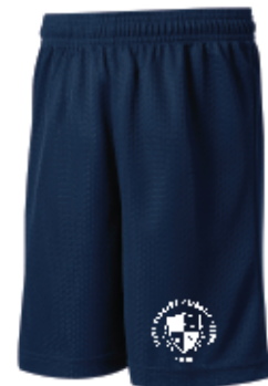
YST510/ST510 Sport-Tek PosiCharge Mesh Short Navy Youth XS-XL Adult XS-4XL