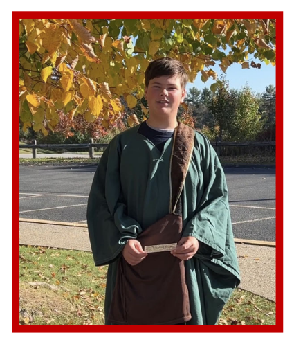
St. Bernard students in Grades 6-8 participated in the Living Saints Museum tour. Students conducted research on several saints. They shared what they learned during live presentations.

The evening event also included fun activities and food. The Knights of Columbus helped to serve hot apple cider and hot dogs to the guests.