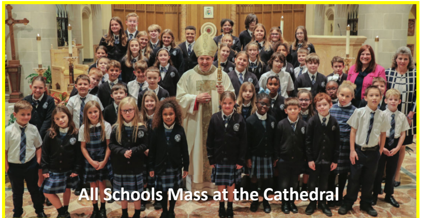
All Schools Mass at the Cathedral