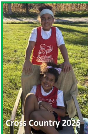
Cross Country 2025